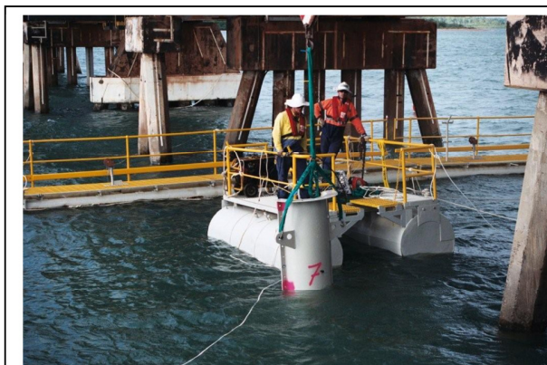
Splint being lowered into place

This has successfully been used to improve the integrity of the Mission River Bridge piles since 2007.