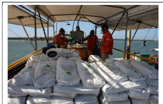
The "grout float" on top of the bridge